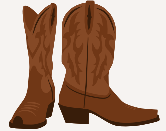
Your Best Boots